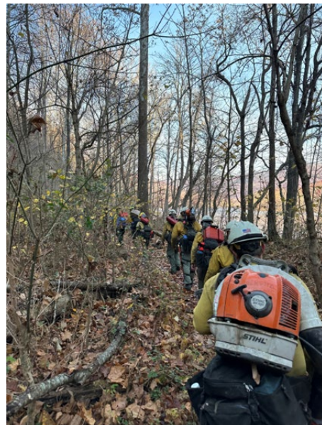
Photo 1: Helicopter flying overhead with bucket; Photo 2: Firefighters hiking to fire line .